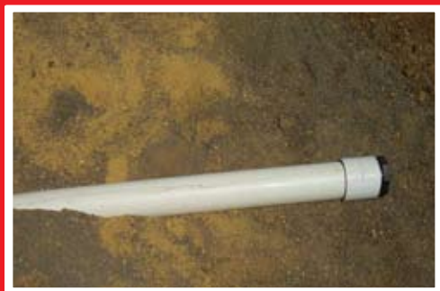
50mm Scour Drain for Cleaning