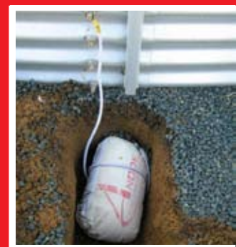
Sacrificial Magnesium Anodes for Corrosion Protection