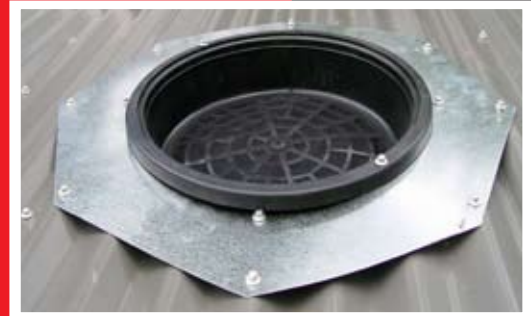
Leaf Filter Basket With Light Guard