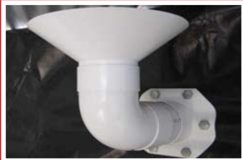
100mm Bell Mouth Overflow