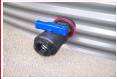
50 mm Outlet & Ball Valve

All tanks in our Standard Range are installed with a food grade polyethylene liner and the following features: