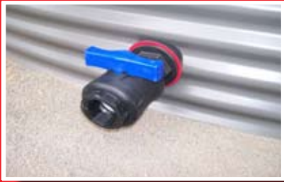
2 x 50 mm Outlets & Ball Valves

All tanks in our Premium Range are installed with a Hydrashield 1000 liner and the following features: