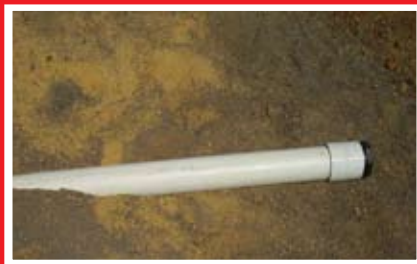
50mm Scour Drain for Cleaning