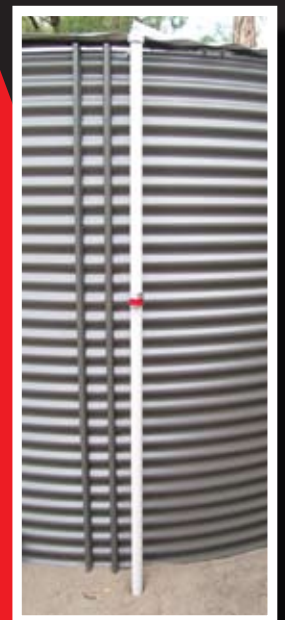
Water Level Gauge