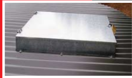
Heavy Duty Lockable Access Hatch