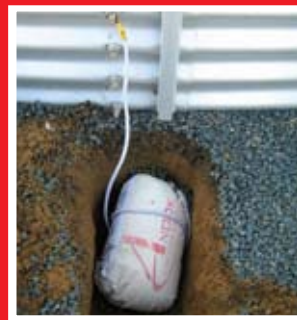
Sacrificial Magnesium Anodes for Corrosion Protection