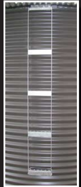
Removable Internal - External Ladder