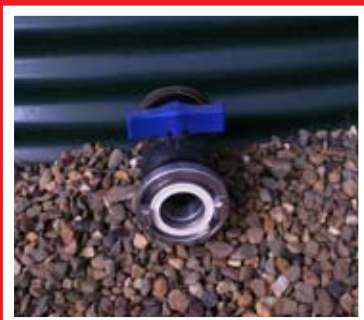
Fire Fighting Coupling (To meet your State/Territory regulations)