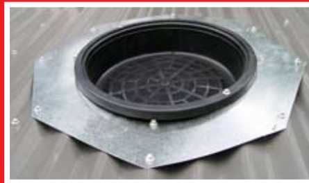
Leaf Filter Basket With Light Guard