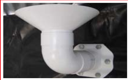
100mm Bell Mouth Overflow